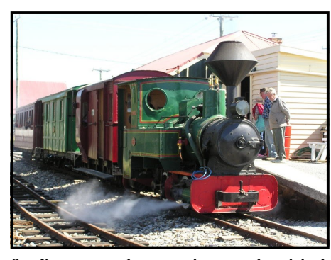
Our Krauss steam loco steaming up at the original Sheffield Railway Station. Both the loco and the station were restored by members of the Society.